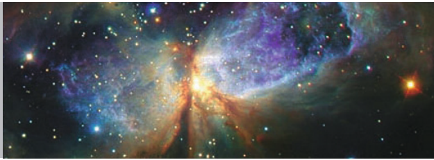
Star forming region S106