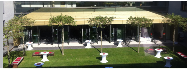
View from the HGSFP central office

Today many exciting developments are occurring across various fields of fundamental physics. In this atmosphere, it is a definitive goal of the most interested doctoral students to extend their knowledge beyond their immediate area of research to neighbouring branches of physics where seemingly disparate fields grow together and depend on each other. Active learning, crossdisciplinary discussions involving students and staff alike, international exchange and mentoring are the key concepts of modern graduate training. A modular training programme and flexible entrance requirements serve to allow easier acceptance of foreign students from different countries, who come to Germany with different degrees according to their countries of origin. Note that the doctoral programme in Heidelberg follows on the Bachelor/Master system.